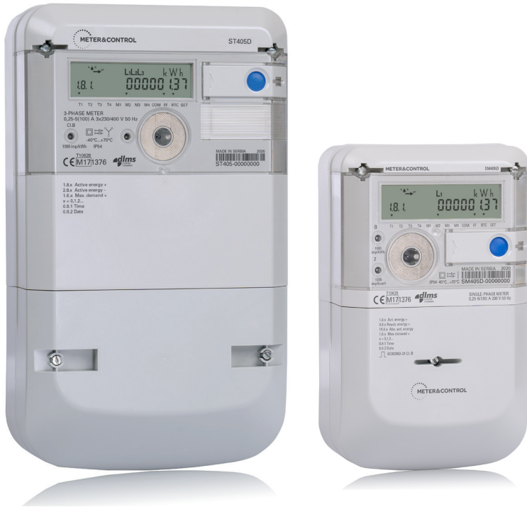
SM405D/ST405D RS485 integrated communication port and switching device

Three-phase and single-phase smart meter with integrated RS485 communication port and switching device