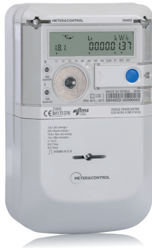
SM405D/ST405D RS485 integrated communication port and switching device